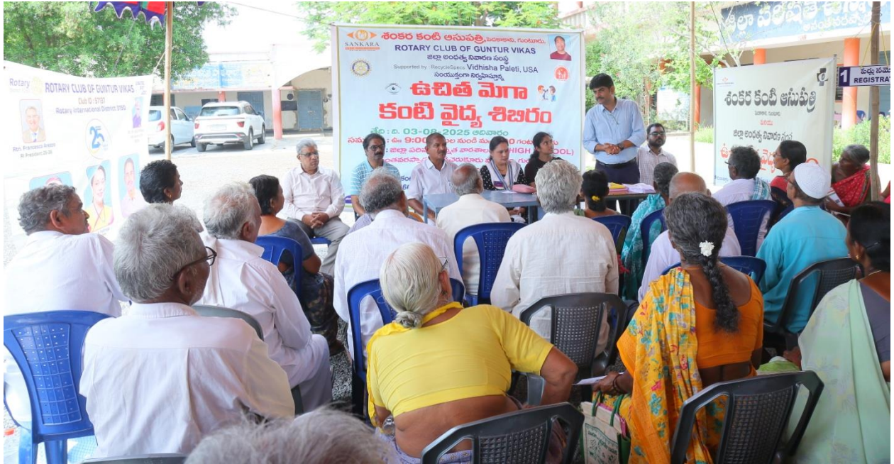
Coordinator of the Eye Camp from Sankara Eye Hospital explaining the patients, about the procedure of screening, surgeries and the facilities provided in the camp