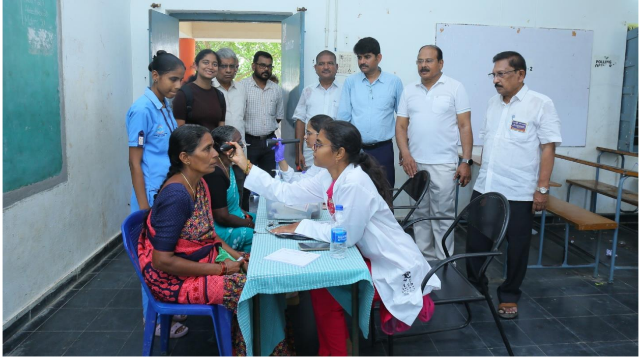
Doctors examining the patients