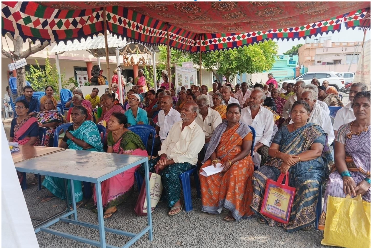
Patients waiting for Registration