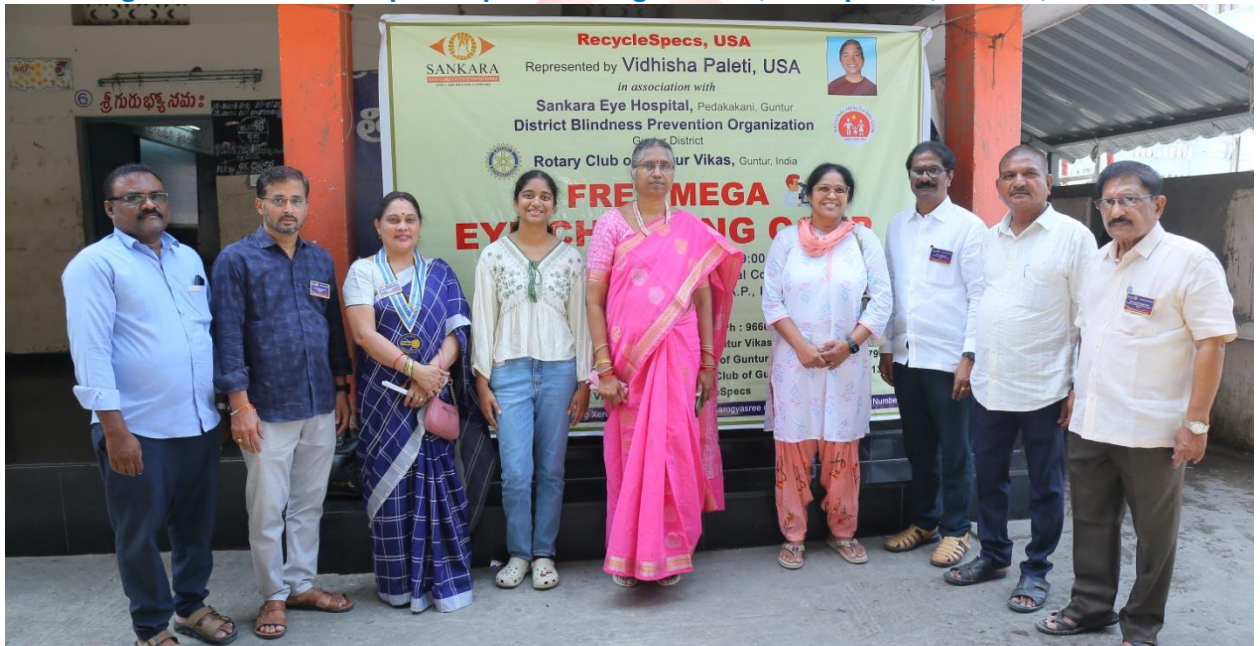
Group photo with Head Mistress of the School at Free Eye Camp conducted at Sri Borra Nageswara Rao Municipal Corporation High School, Manipuram, Guntur, on 02.08.2025