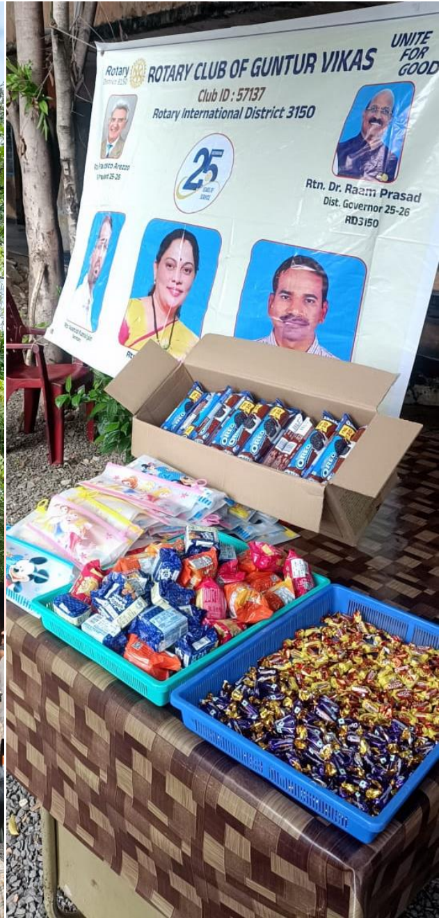
Flag Hoisting was done on Independence Day at Guntur Municipal Corporation Elementary School, Saradapuram, Guntur. Stationery kits were distributed to students. Chocolates and biscuits were given to all 100 students.