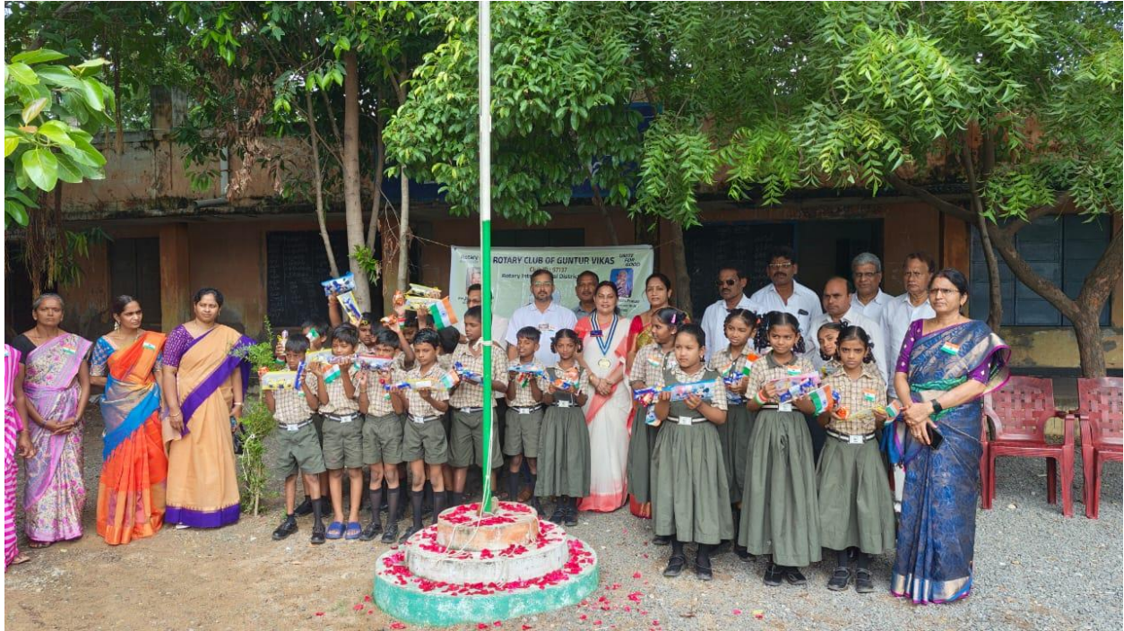
Group photo of Teachers and Students of Guntur Municipal Corporation Elementary School, Saradapuram, Guntur, with our Members