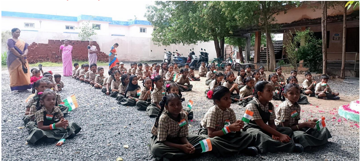
Students of Guntur Municipal Corporation Elementary School, Saradapuram, Guntur