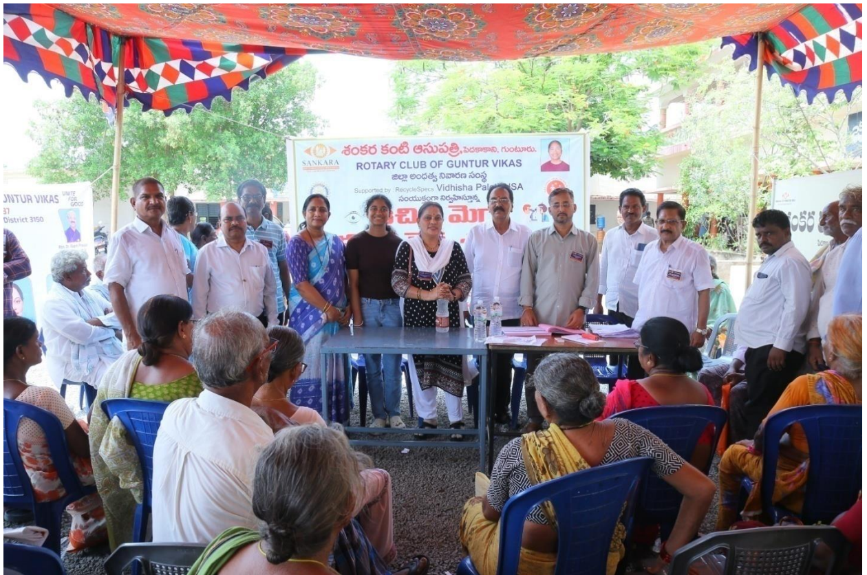
Group photo of our Members at Eye Camp conducted at Ananthavarappadu village, on 03.08.2025