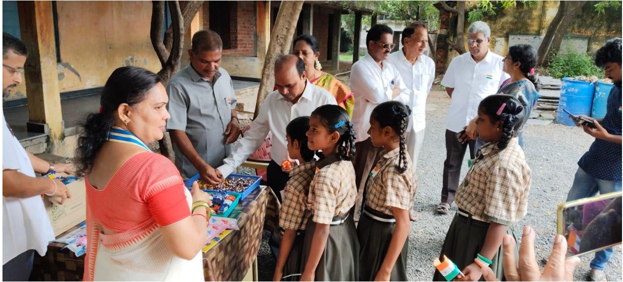
Distribution of Stationery kits, Chocolates & Biscuits to students of Guntur Municipal Corporation Elementary School, Saradapuram, Guntur