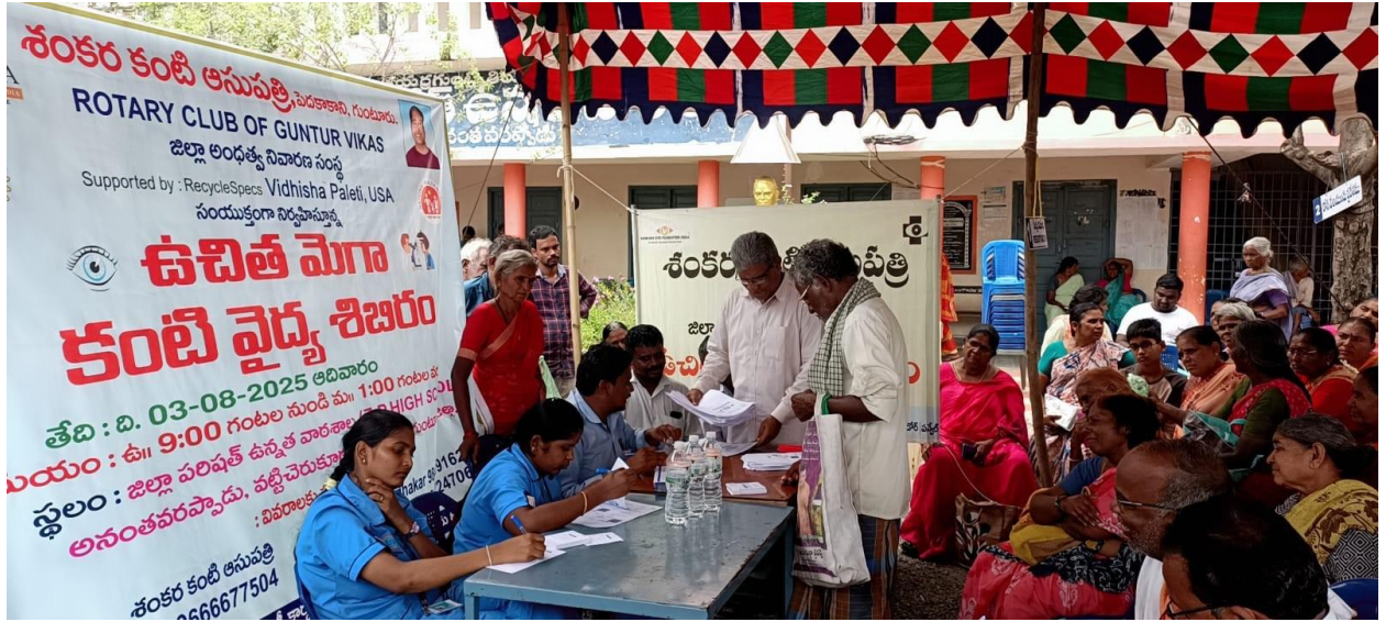
Registration of Patients at Eye Camp