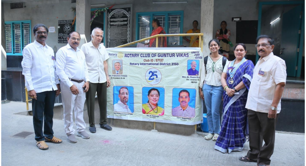
A Free Eye Camp was conducted at Sri Borra Nageswara Rao Municipal Corporation High School, Manipuram, Guntur, on 02.08.2025