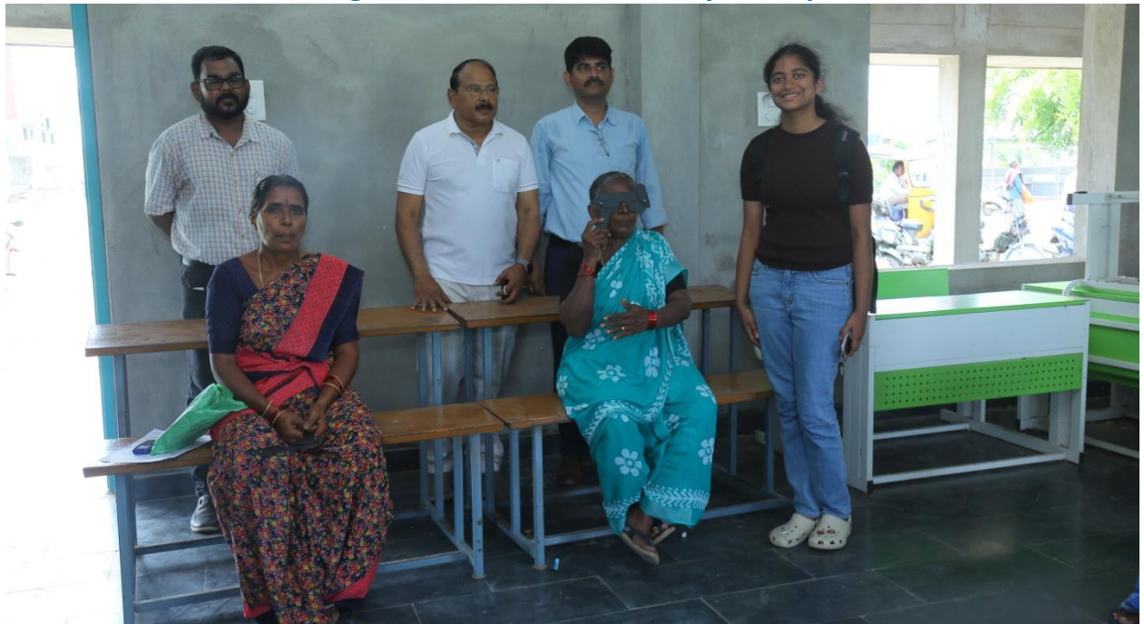
Eye sight checking